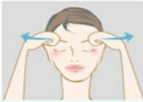
2. Place your thumb against your temple and press gently outward from the center to your temples