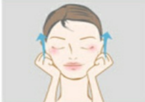
5. Clench the fist from bottom to top massage to stretch to raise