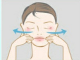
4. The hands slide on each side of the cheekbone in a curved shape