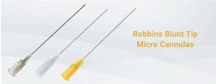
Robbins Blunt Tip Micro Cannulas

A blunt cannula allows blood vessels to be 'pushed aside' as the microcannula moves around the tissue under the skin instead of piercing the blood vessels as with traditional needles. Safety from injuring nerves. Safety from injuring blood vessels. Safety from injuring glands and ducts. Better Results: you can get a smoother and wider fanning result. Better Results: you can usually have less bruising with your patients. Better Pain management: Patients usually feel less pain with this technique.