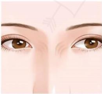
Nasal dorsal stria