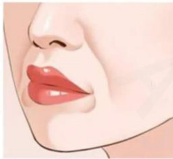
Mouth corner pattern