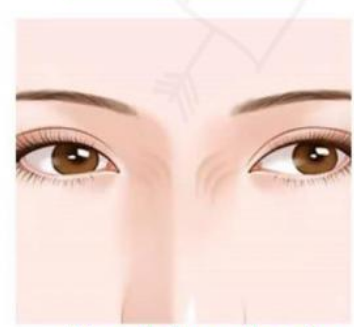
Nasal dorsal stria