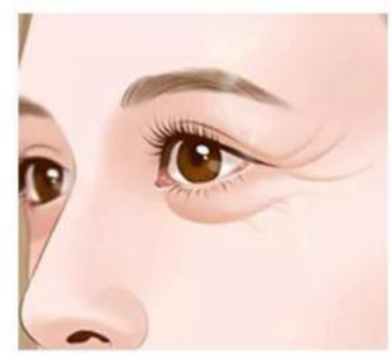
Fish tail pattern