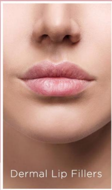
Dermal Lip Fillers