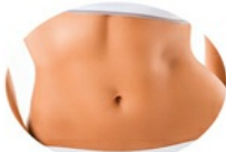
Abdomen, side (Love handle)