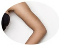
Armpit, upper arm