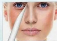
Anti-aging skin replenishing