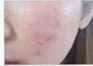
Mild and Moderate acne