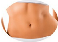
Abdomen, side (Love handle)