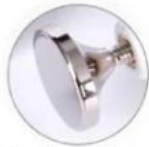
Help import essence

Black spot Granulation tissue Small spot Pigmentation Black mole Small spot Mole Spot Verruca Fleshy nevus Wart Tattoo.