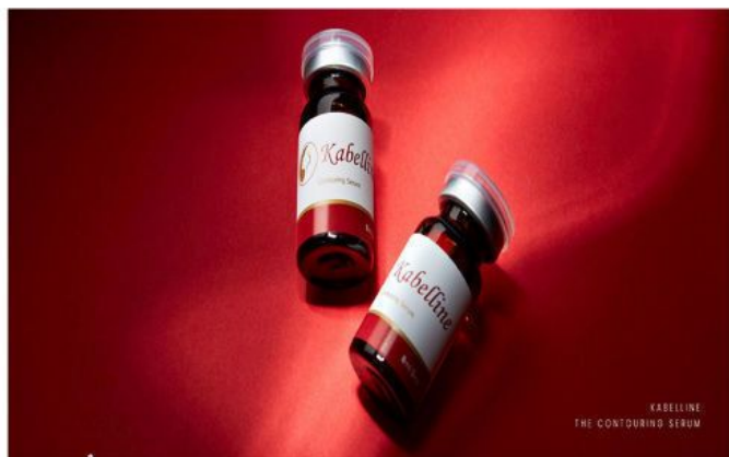
Contouring Serum for localized fat reduction

01 Upregulates Lipolysis, inhibits Lipogenesis