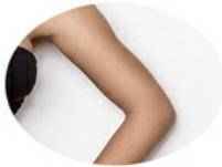
Armpit, upper arm