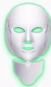
Green Row of edema Reduce skin grease