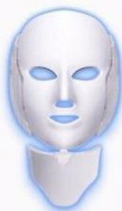
Blue Sterilization Inhibit inflammation