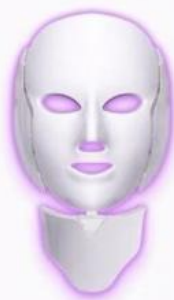
Purple Remove acne scars