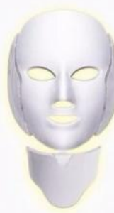
Yellow Energy to skin