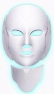
Cyanine Promote metabolism