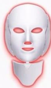
Red Whitening Skin wrinkles