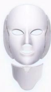
White Remove Freckle